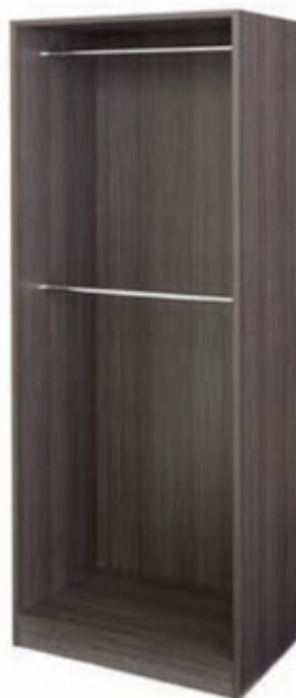
Hanging Rail Unit

H: 2000mm (walk-in) 1750mm (built-in) W: 500 or 700mm D: 450mm