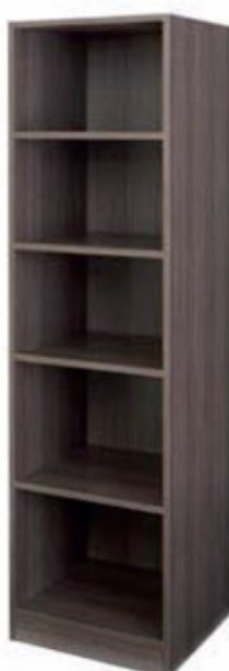
Open Shelf Unit

H: 2000mm (walk-in) 1750mm (built-in) W: 800 x 800mm D: 450mm