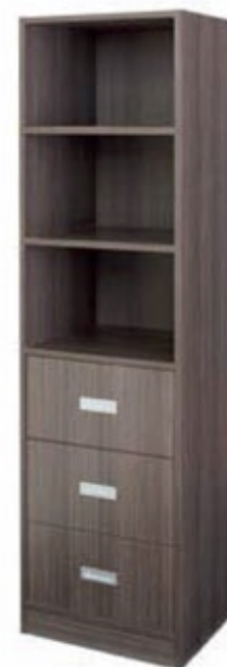
3 Drawer Shelf Unit

H: 2000mm (walk-in) 1750mm (built-in) W: 500 or 600mm D: 450mm