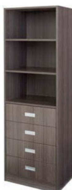
4 Drawer Shelf Unit

H: 2000mm (walk-in) 1750mm (built-in) W: 500 or 600mm D: 450mm