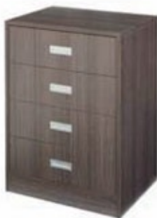
Base 4 Drawer Unit