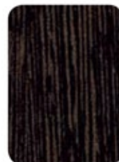
Straight Grain Wenge