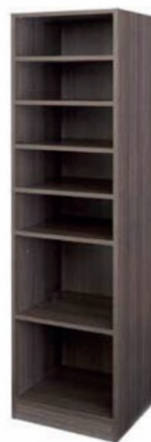
Open Shelf / Shoe Rack

H: 2000mm (walk-in) 1750mm (built-in) W: 500 or 700mm D: 450mm